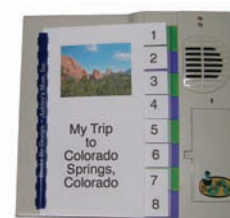
Books-By-Design™ and BookWorm™